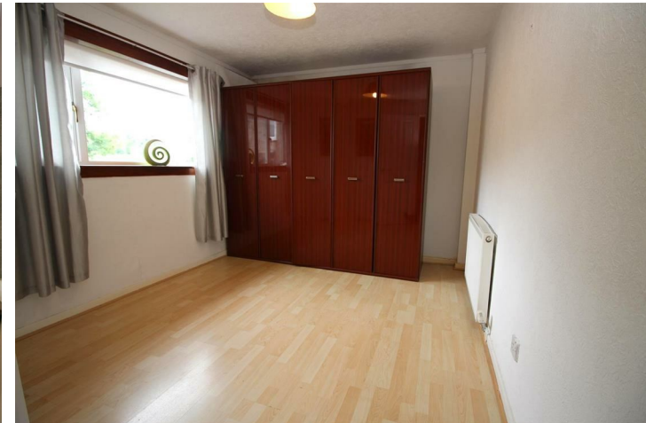
Bathroom 6'0" x 5'3" (1.85 x 1.61)